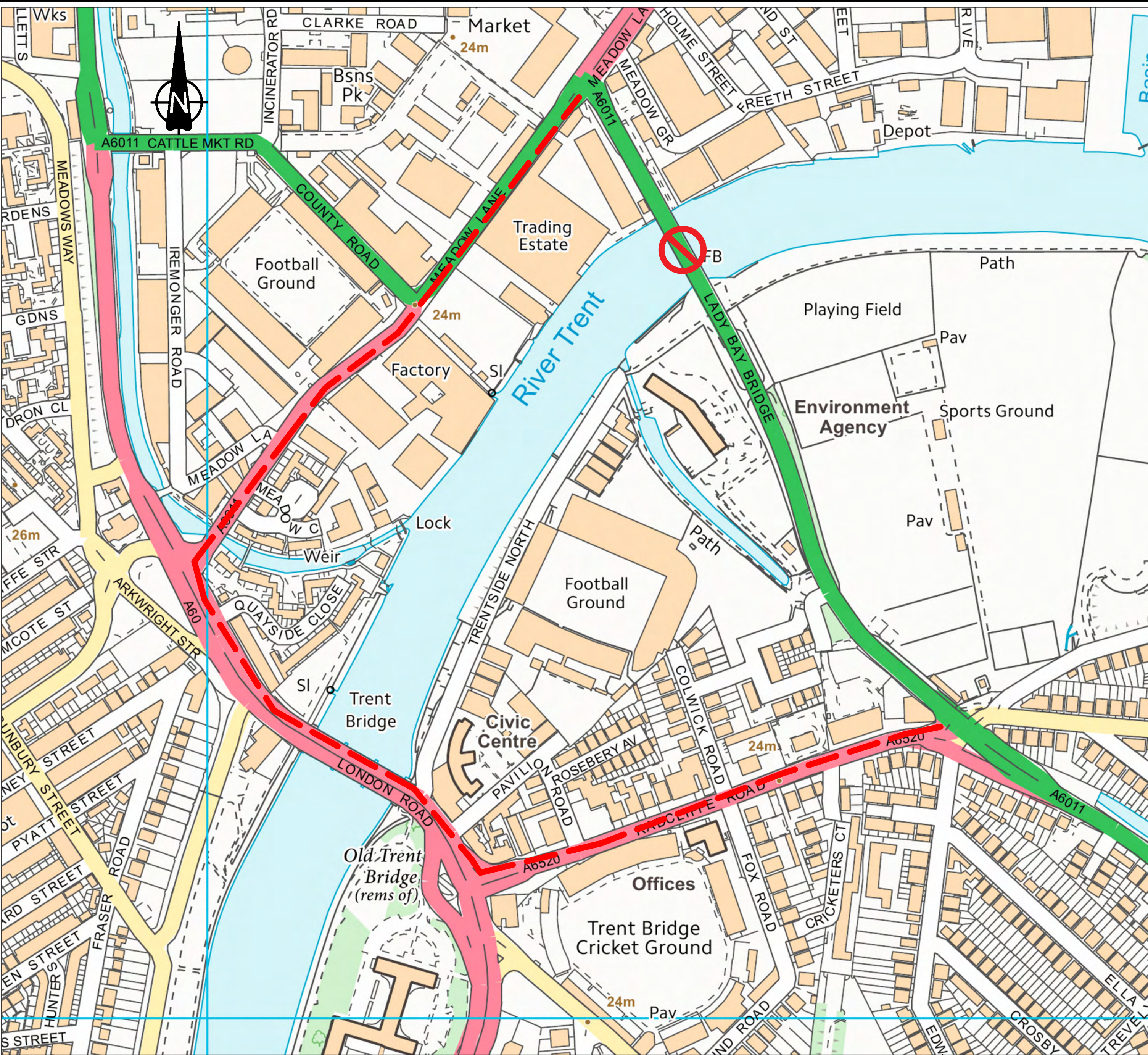
LADY BAY BRIDGE - FOOTWAY DIVERSION ROUTE (RED - - - ) N.T.S.

HIGHWAY Full Road closures, weekdays, overnight 20:00-06:00 07/07/2025 - 17/08/2025